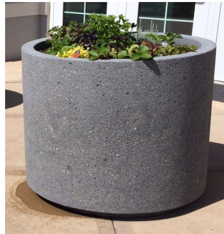
*Shown here in Charcoal concrete color and LSB finish.