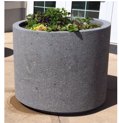
*Shown here in Charcoal concrete color and LSB finish.