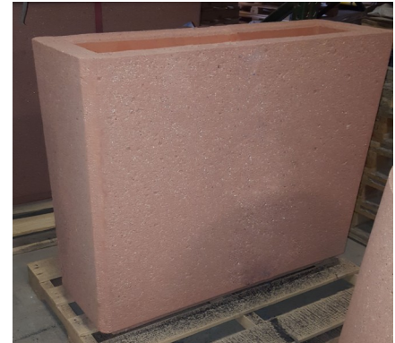
*Shown in Terra Cotta color and Weathered finish.